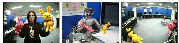
Figure 1: Setup for the imitation experiments between Infanoid and a human experimenter. In the left image, the human subject holds the two coloured object in each hand, trying to imitate the robot that is performing random arm movements. In the center image, the robot is displayed holding the two coloured objects by itself, also performing random arm movements. The right image shows the objects as seen by the robot.

Motor data: left arm: shoulder open, shoulder turn, elbow open, elbow turn, wrist open, wrist turn, right arm: shoulder open, shoulder turn, elbow open, elbow turn, wrist open, wrist turn