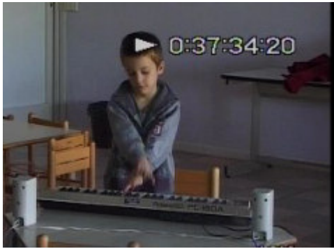
Figure 3: Some examples of interesting interactions: a) Surprise and Aha Effect; b) Excitement; c) Attentive Listening; d) Joint Attention; e) Improvisation.